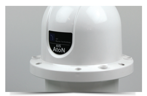
Designed for internal or external deployment in even the harshest marine environment