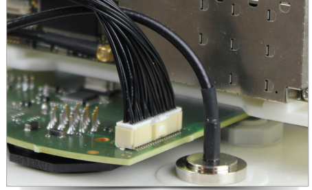
Ultra low power consumption minimises overall system installation costs