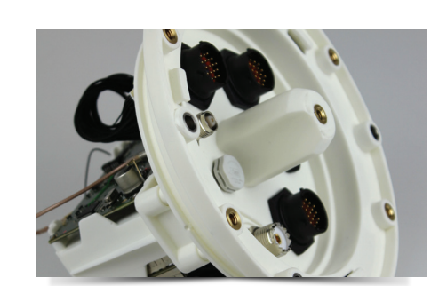
Multiple external interfaces facilitates easy integration with external devices