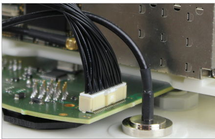
Ultra low power consumption minimises overall system installation costs