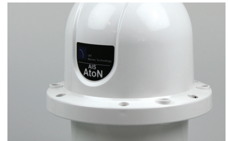
Designed for internal or external deployment in even the harshest marine environment